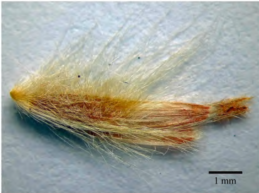
Fig. 5. Eulalia simonii . Pedicellate spikelet (Ridley BES 00767, PERTH).

Affinities: Eulalia simonii has a quite different form to Australian material referred to as E. aurea . It forms clonal patches to more than 3 m across of small tussocks joined by long underground rhizomes (Fig. 8). The individual tussocks are fewer culmed and shorter than those of E. aurea , which in the Pilbara usually occurs as single tussocks, not in patches. The broader leaves of E. simonii that become prominently curled on maturity easily distinguish it from other Pilbara Eulalia material, as do the paler, more robust and more densely hairy inflorescences with shorter or no visible awns.